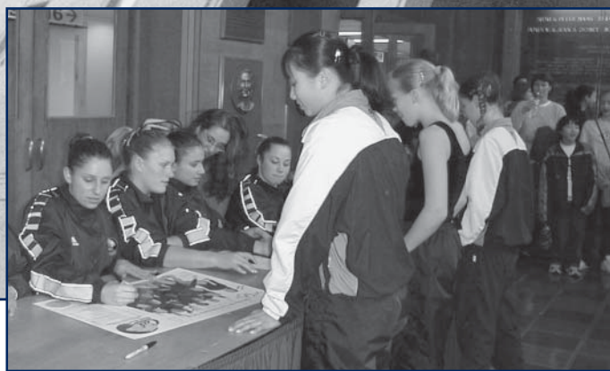
After each home meet, Cal gymnasts sign autographs and meet with fans at Haas Pavilion.

million to get the project underway. Cal alumni supported the renovation in an unprecedented manner, as $41 million of the final price came from private gifts. The